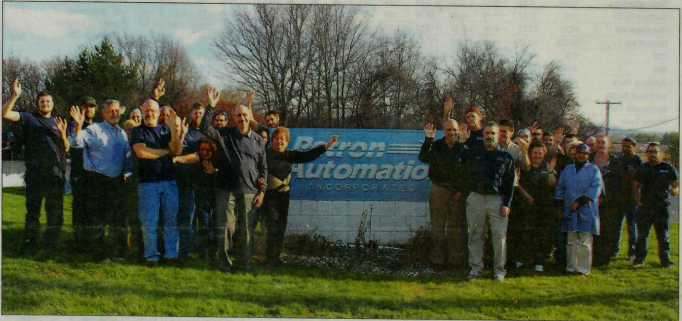
Petron Automation, its employees seen outside its Watertown factory, will be named Manufacturer of the Year at the Harold Webster Smith Awards annual breakfast on Feb. 3.